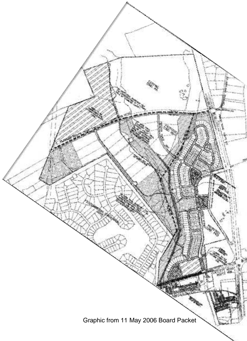
Graphic from 11 May 2006 Board Packet

Freedom Place Concept Plan Approved 11 May 2006 358 Residential Units