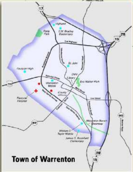
Town of Warrenton